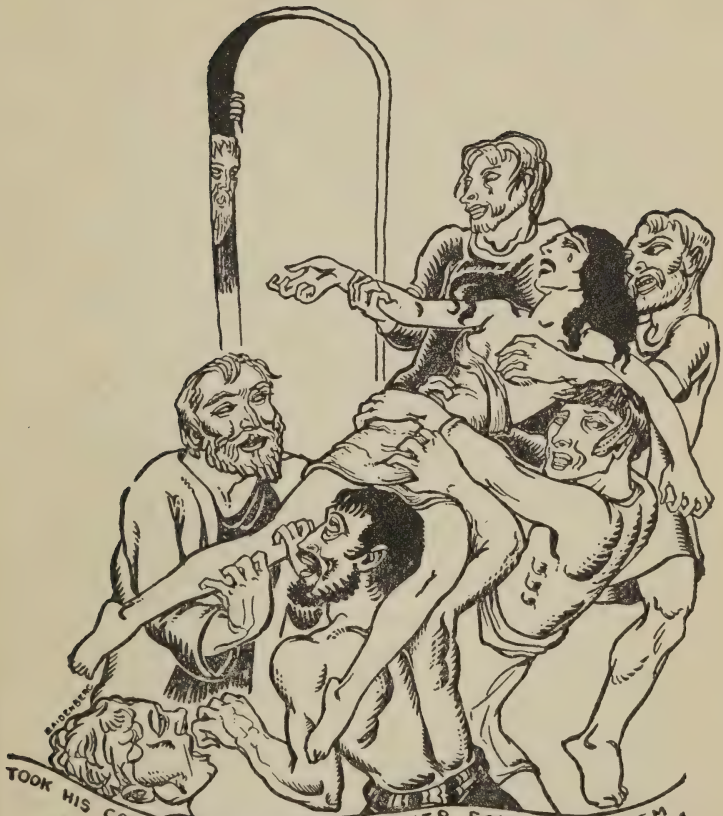
TOOK HIS CONCUBINE AND BROUGHT HER FORTH UNTO THEM JUDGES CHAPTER IV VERSE 25